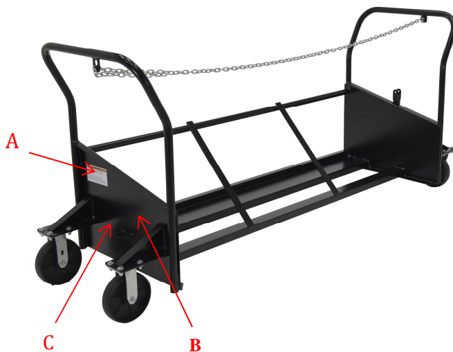
A: Label 867

The unit should be labeled as shown in the diagram. However, label content and locations are subject to change so your product might not be labeled exactly as shown. Replace all labels that are damaged, missing, or not easily readable (e.g. faded). To order replacement labels, contact the technical service and parts department online at http://www.vestilmfg.com/parts_info.htm . Alternatively, you may request replacement parts and/or service by calling (260) 665-7586 and asking the operator to connect you to the Parts Department.